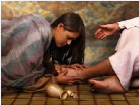
Anointing at Bethany

Jesus has encountered humanity at its worst, yet he prays for forgiveness of the very ones who have crucified and abused him. Perhaps we should not be surprised by Jesus' unfailing